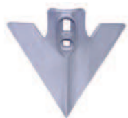
513 - 0 C/N